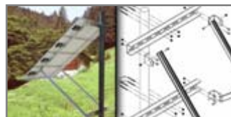
Side-mounted solar panel